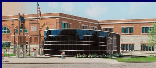
Allen Co. Intermediate Ctr. 4-6

Menus are distributed to each elementary student, published in The Citizen-Times , posted on the school website at www.allen.kyschools.us and also announced daily on WVLE radio.