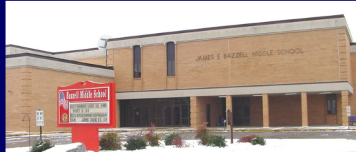
James E. Bazzell Middle School 7-8