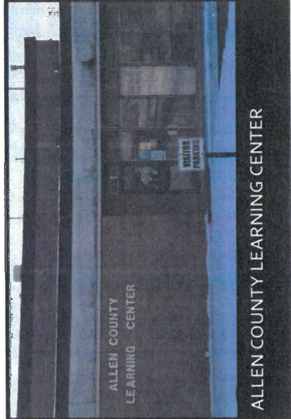
ALLEN COUNTY LEARNING CENTER