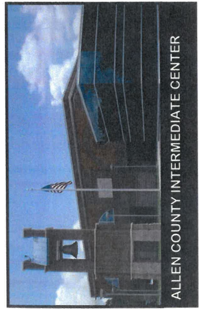
ALLEN COUNTY INTERMEDIATE CENTER

Menus are distributed to each elementary student and are also available at the following: The Citizen-Times, WVLE Radio, www.allen.kyschools.us and MealViewer app.