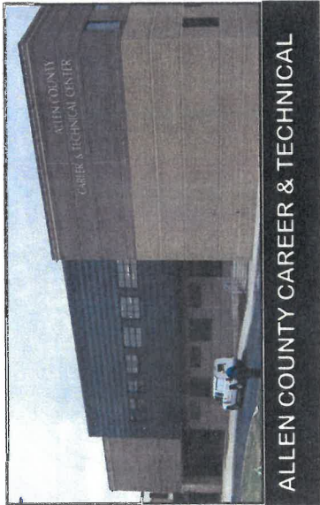
ALLEN COUNTY CAREER & TECHNICAL