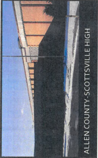
ALLEN COUNTY-SCOTTSVILLE HIGH